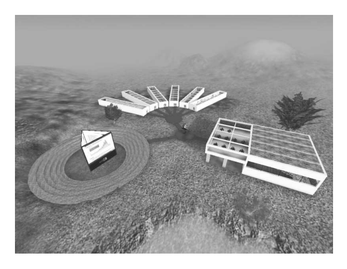
Figure 1: The MediaSquare.

presence of voice, timbre, etc. and act as features for the training of a self-organizing map (SOM) to arrange similar music tracks in spatially adjacent regions. More specifically, the self-organizing map is an an unsupervised neural network model that provides a topology-preserving mapping from a high-dimensional input space onto a two-dimensional output space [3].