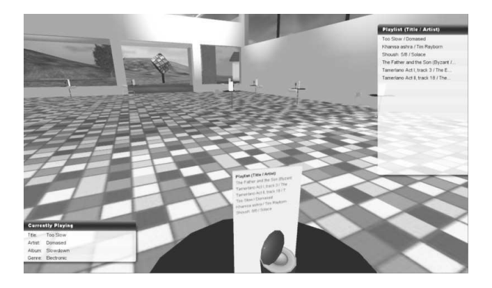
Figure 3: Music showroom with GUI elements.