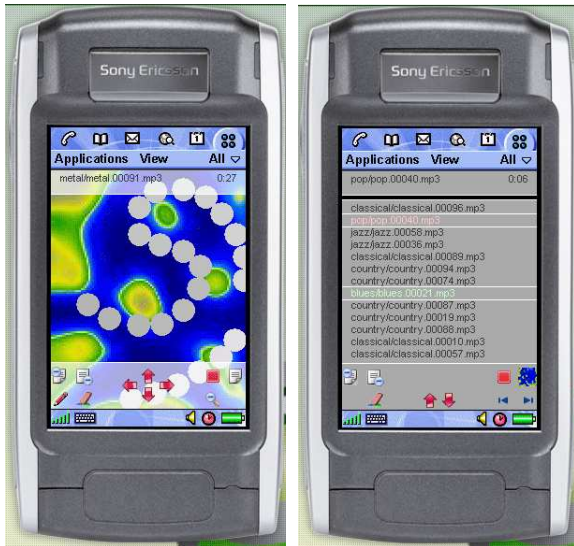
(a) Zooming enabled (b) Playlist editing on the mobile m-PocketSOM.