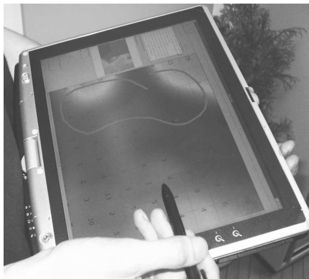
Figure 2. PlaySOM running on a Tablet PC.

Since the SOM clustering itself does not convey any additional information that could help in a better understanding of the data, various visualisations have been proposed. The main goal of visualisation is to provide a more intuitive and understandable view on the data map. Besides, plain SOM clusterings do not include visual enhancements of any kind and seem rather unattractive to end users. SOM visualisations can be based on more than one level: the high-dimensional input space and the two-dimensional output space, or combinations thereof. Visualisation based on single components of the input vectors take into account the elements of the input space, the most commonly used method is Component Planes, i.e. the colour-coding of single components. The Rhythm Patterns visualisation, for instance, is based on colour-coding different groups of components, illustrating different sonic aspects like low frequencies and bass-dominated music. A visualisation technique that shows the local cluster boundaries by depicting pair-wise distances of neighbouring prototype vectors, the unified distance matrix (U-Matrix), is described in [10]. It is