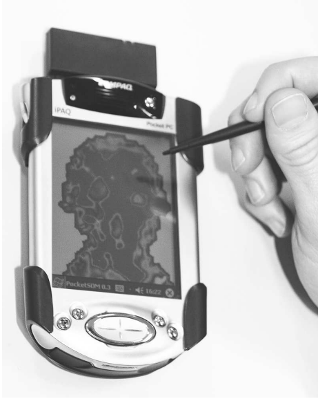
Figure 3. Mozart's complete works displayed in i-PocketSOM running on a PDA.

collections. Secondly, a range of selection models can be applied, allowing for playlist generation in an intuitive way, allowing for easy selection of smooth transitions between musical styles.