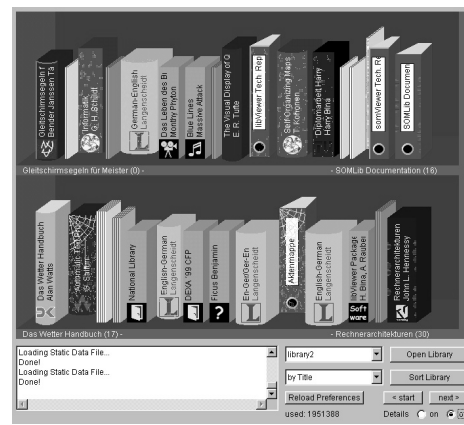
Figure 1. libViewer: Visualizing metadata of documents in a digital library

Further attributes are mapped in a similar fashion, e.g. having the logo identify the publisher of a book if a corresponding logo is available (e.g. Springer, Langenscheidt, Vieweg), or having the thickness of the binding represent the size of the underlying resource as for the different Langenscheidt Dictionaries. Another straight-forward mapping is provided by the degree to which dust has accumulated on the back of the books, ranging from a few dust particles to