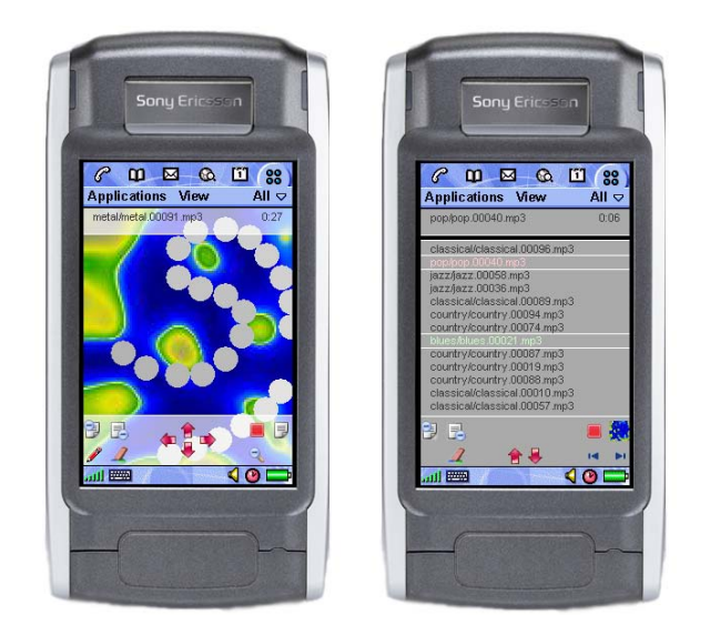
Fig. 4. MobileSOM on a Sony Ericsson P910 Emulator, with the Map Interace on the left and the Playlist Editor on right side