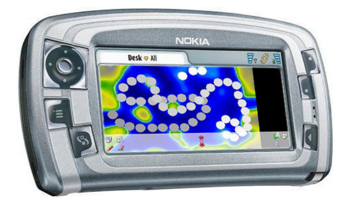
Fig. 1. MobileSOM on a Nokia 7710 Device

pre-processed data is ready to be used via the MobileSOM software. In Section 4 generating playlists on mobile devices is discussed. Section 5 takes a closer look at the software itself, describes its features and presents experiences on running the software on emulators and real world devices. In the last section conclusions as well as an outlook on future work is given.